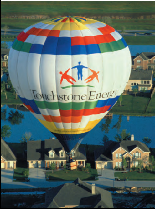
The Power of Human Connections